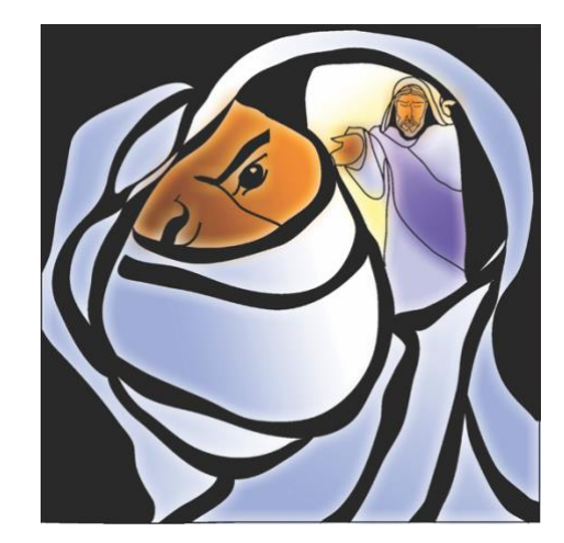
Visuals - Sundays and seasons.com Copyright © 2024 Augsburg Fortress. All rights reserved